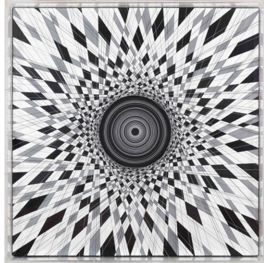
托马斯 坎托 Thomas Canto

angles in relation to the artworks. With bright colors and recurring patterns, Canto's works often depict a cosmic blast bursts from the center to the peripheries, radiating intensive energy. In his artist-in-residency at the Bains Douches in 2013, Canto extended the optical illusions he created on the painted surfaces into three-dimensional space, producing a magnificent installation that simultaneously engages and penetrates space and time.